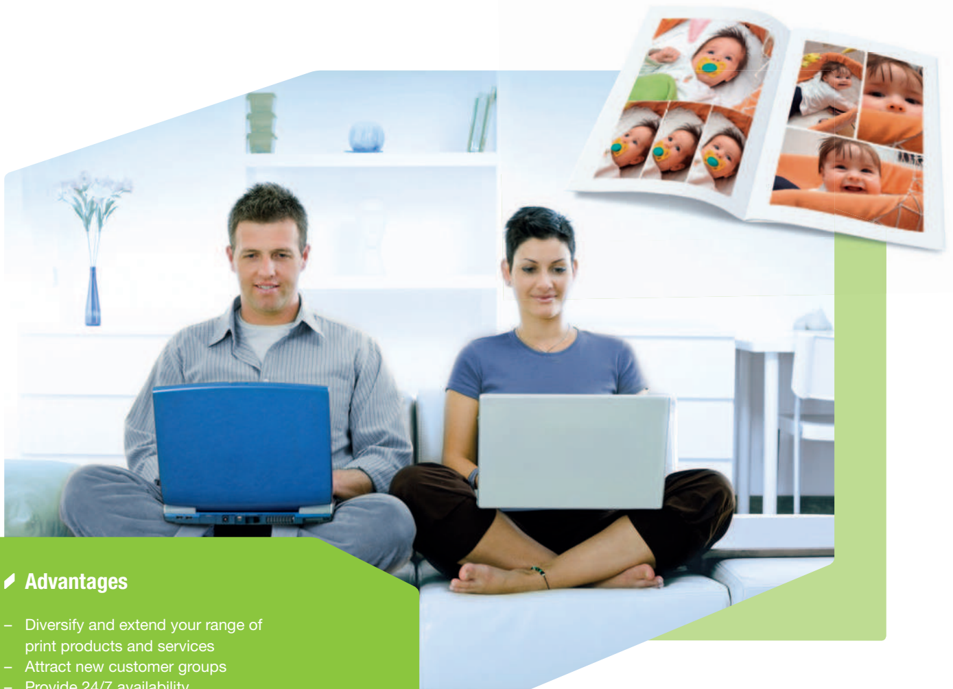
Photo book creation is an easy and attractive enhancement of your online print offering. Via a photo book application, you provide your customers with easy yet extensive online layout possibilities to create albums or calendars with their photos of holidays, events and other occasions. Similar to other web-to-print applications, photo book software includes online submission, payment and tracking, right down to the final delivery or collection of the printed photo book.

“Expand your services and grow your revenue.”